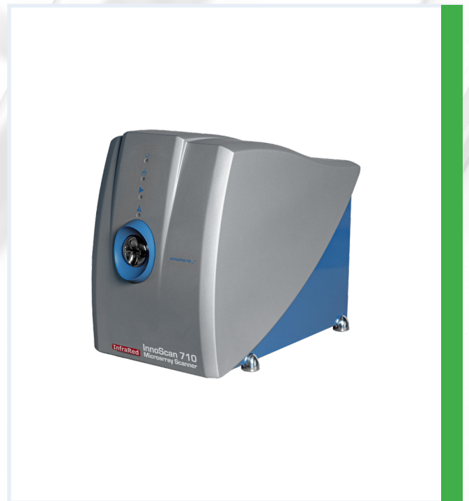
Image acquisition & analysis software

From 10 to 35 lines per second Test results obtained very quickly 3.6 minutes to read and entire slide with 10µm/pixel